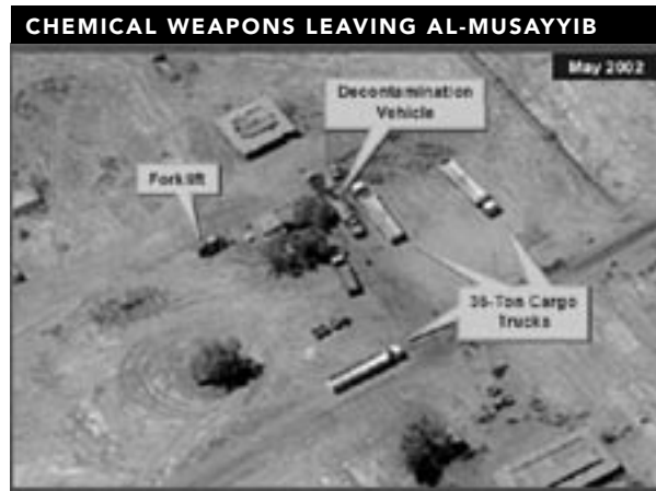
Briefing slides from Secretary Powell's February presentation to the UN.