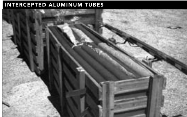
Briefing slide from Secretary Powell's February UN presentation.